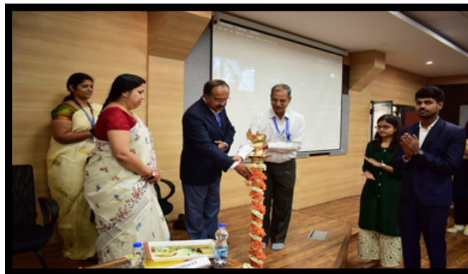
Lightening the Lamp by Delegates